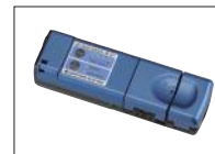
Hot jacket remover JR-6+