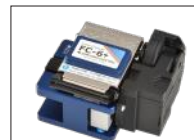
Table-top cleaver FC-6+ series