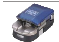
Handy cleaver FC-8R series

Does not guarantee the product will not be damaged by these conditions.